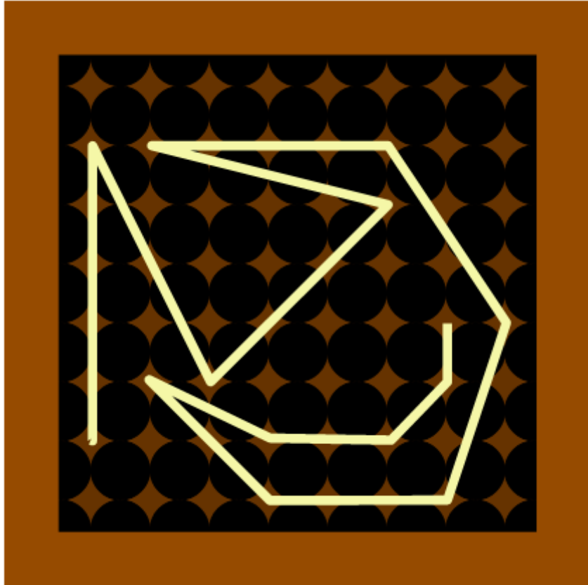
A spaghetum with 14 points.